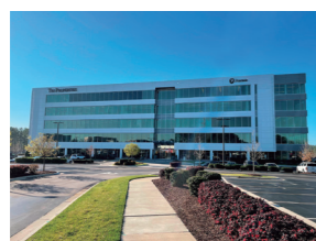
1 K-I CHEMICAL U.S.A. INC.