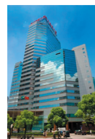
11 KUMIAI CHEMICAL SHANGHAI CO., LTD