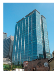
10 KUMIKA KOREA CO., LTD.