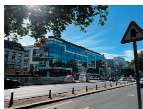
2 K-I CHEMICAL EUROPE SA/NV