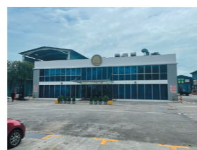
3 Asiatic Agricultural Industries Pte. Ltd.