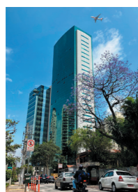
3 K-I CHEMICAL DO BRASIL LTDA.