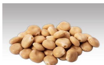
Sweet lupin beans

PROBLAD SL is a novel agricultural fungicide containing plant-derived polypeptides, discovered and developed by the Portuguese company CEV, S.A., as its active ingredient.